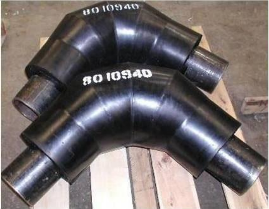
PREINSULATED 90 DEG ELBOWS