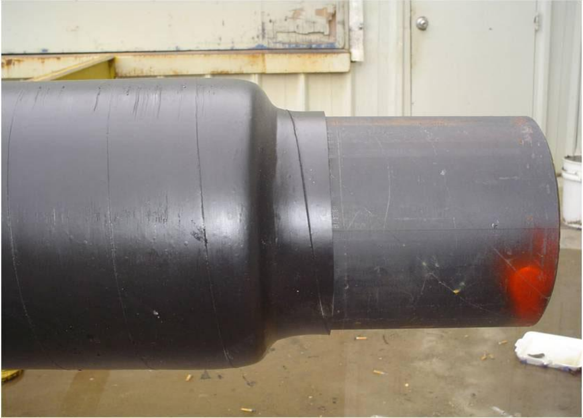
PREINSULATED PIPE WITH HDPE EXTRUDED END SEAL